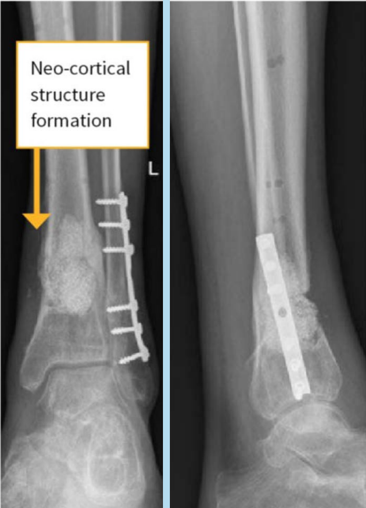
2 months post-op